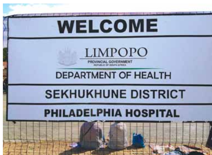
Patients who need special treatment are turned away at Philadelphia Hospital in Dennilton as doctors are on a go-slow.