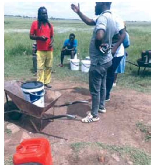
The burden of fetching dirty water from streams and wells will be over in Moutse as the district municipality promise that the Moutse Bulk Water Scheme will soon be completed.

According to Sekhukhune District Municipality, a large portion of the Moutse Bulk Water Regional Scheme is completed.