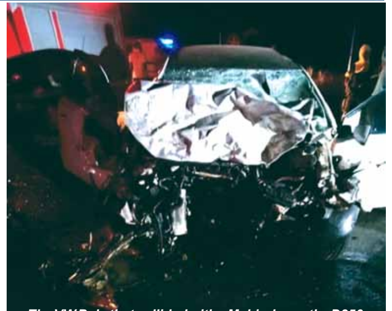
The VW Polo that collided with a Mahindra on the D856 Road in Dennilton where three people lost their lives.

The lowest number of fatalities were reported in Northern Cape and Free State, where only two people died on the roads in the provinces.