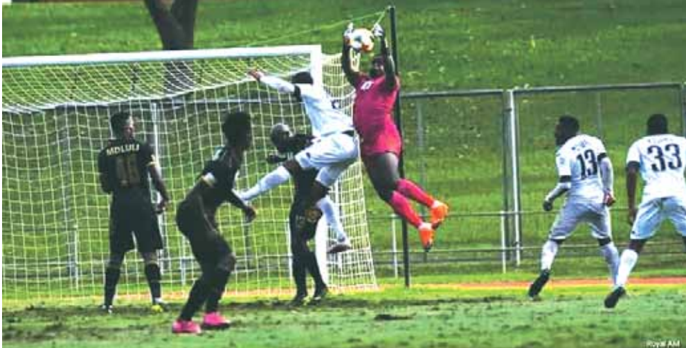
Sekhukhune United on the attack during their match with Royal AM at Chatsworth Stadium in Durban.