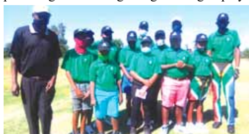
Golf players during the launching of Sekhukhune Golf Development at the Groblersdal Golf Course.