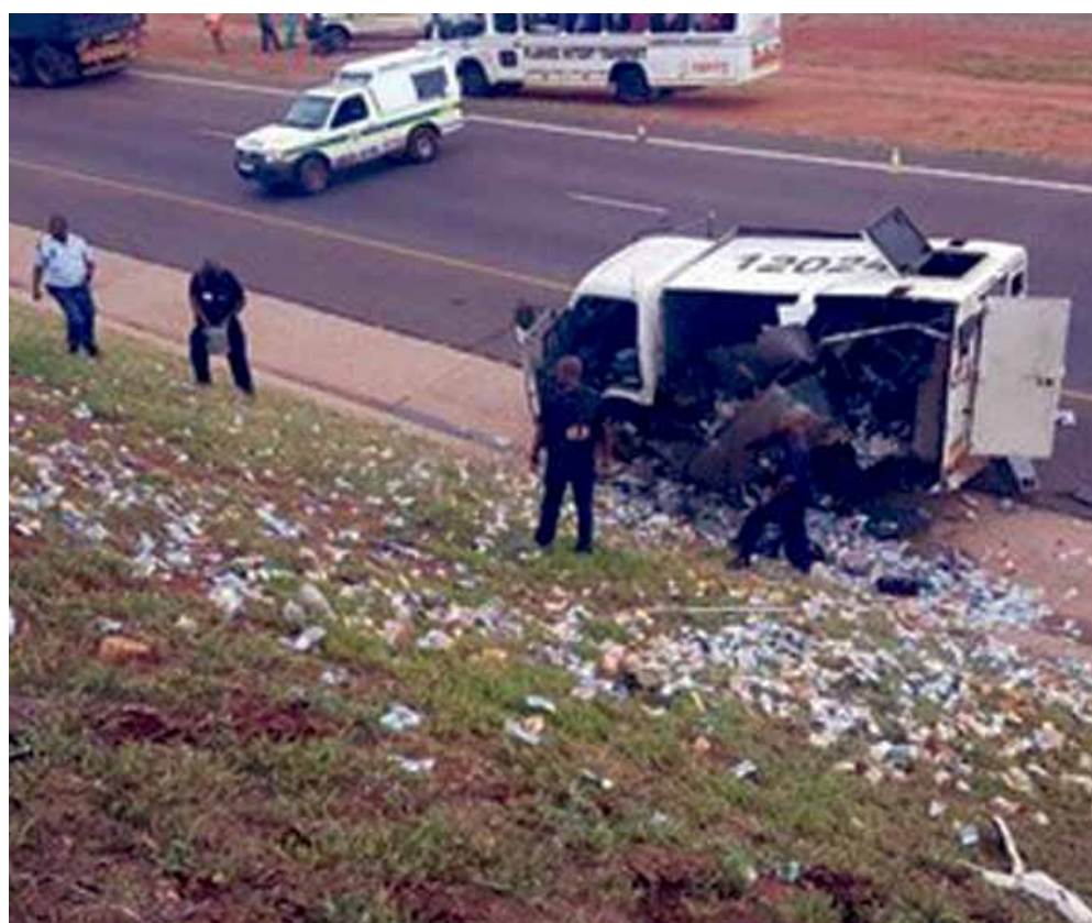
Community members and motorists helped themselves to the money that scattered on the road after criminals blasted two cash delivery armoured vans.

When the police arrived, the people could not be deterred and continued to collect what