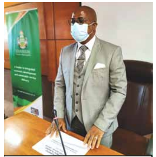
The Executive Mayor of Sekhukhune District Municipality, Cllr Stanley Ramaila, during SODA event at Leboeng Village.

the Mayoral Priorities we have set during the inauguration of this fourth council in 2016, remains. We said we will unlock the blockages in mega water projects such as Moutse Bulk Water Supply, Mooi-hoek Scheme, Nkadameng Scheme, De Hoop Scheme, Ga-Malekane Bulk pipeline, to name but a few,” Ramaila informed. Furthermore, the executive mayor hinted that the municipality will stick to its vow to ensure sound financial management, improve the liquidity ratio, enhance revenue collection and strive towards obtaining clean audit opinion. “We will remodel and capacitate Sekhukhune Development Agency (SDA) to fulfil its mandate as a vehicle for economic development and growth of our district. We shall confront the toxic mix of corruption, fraud and maladministration,” he said. In terms of resolving financial strain and poverty faced by Sekhukhune residents following the outbreak of Covid-19, Ramaila said a conducive labour and entrepreneurship skill condition will be utilized for the people of the district municipality. “We have assigned the Sekhukhune Development Agency, an entity of the district municipality, to develop an economic recovery strategy that will harness social compact by unlocking investment opportunities in various economic sectors through public-private partnerships,” he said.